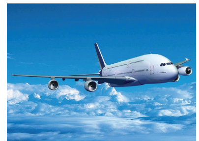
Accepted for use by major aircraft manufacturers.